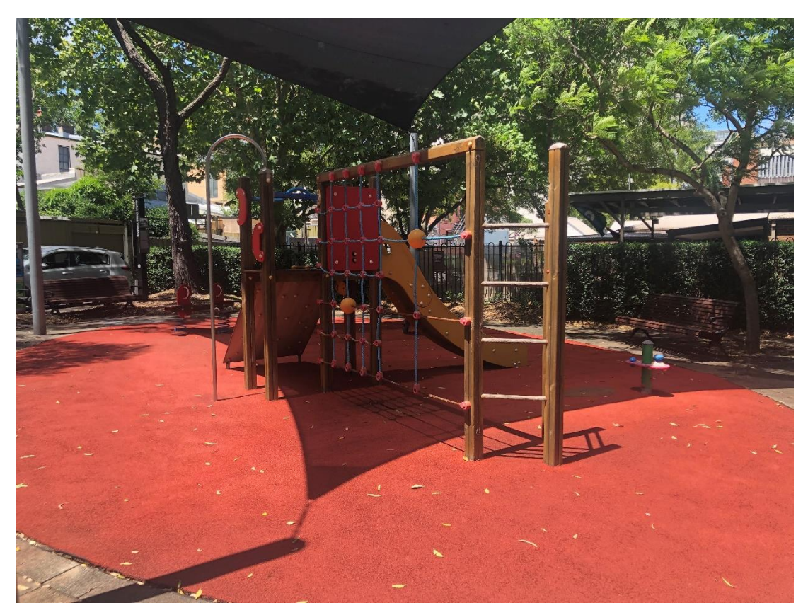
Existing playground in the reserve – play equipment is at the end of its lifecycle; soft-fall is worn and separating from edges. Playground is well shaded from the existing trees and shade structure.