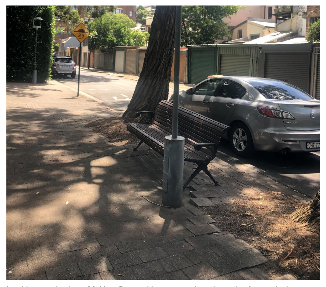
Looking north along McKee Street. Uneven paving along the footpath due to tree roots.