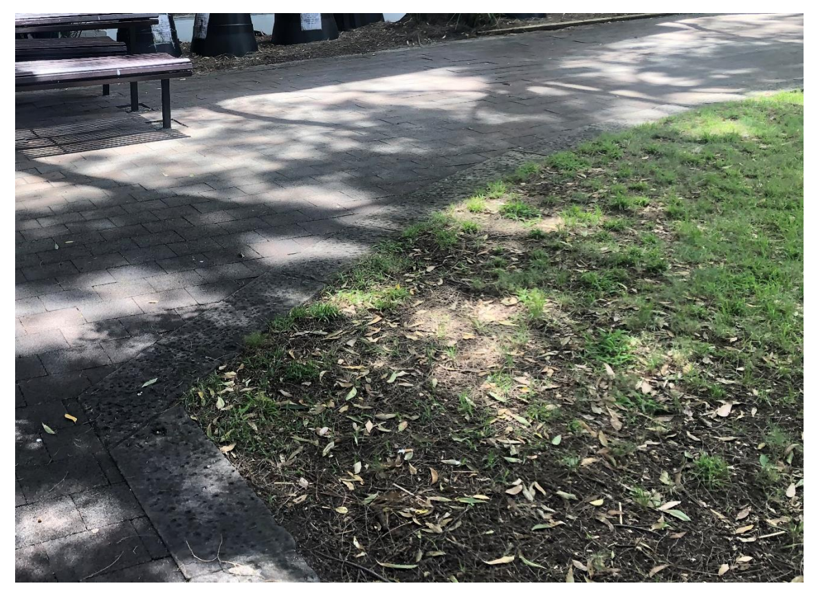
Small area of turf at northern end in poor condition.