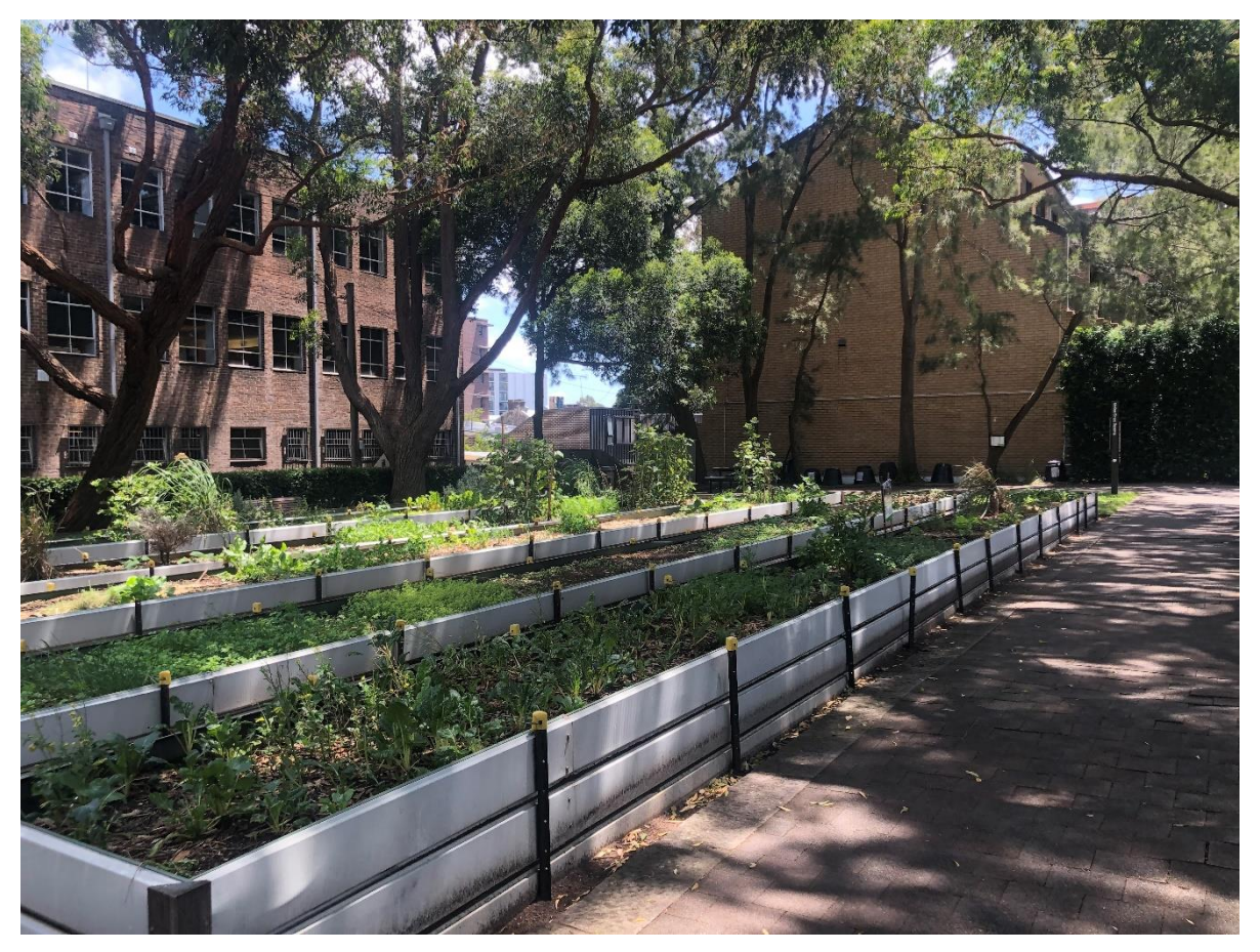
Garden beds are well-managed and utilised by local community garden group.